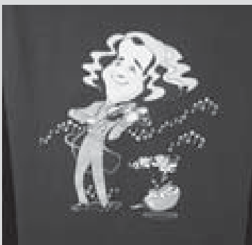
● André Rieu T-shirt