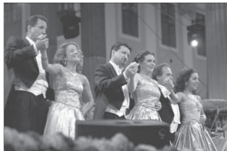
● Some of the cast members of the Johann Strauss Orchestra