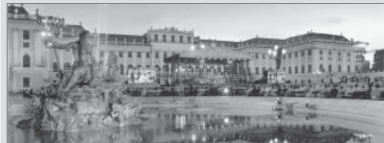
● The portable concert set coming to Melbourne

■ A full-size copy of the Imperial Schönbrunn Palace will be erected at Telstra Dome in Melbourne for André Rieu's concert late next year.