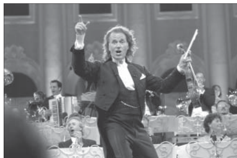
● André Rieu conducts the Johann Strauss Orchestra

"I hope I may be given many more years to make people happy with my music!"