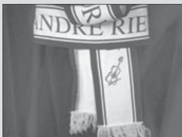
● André Rieu concert scarf

Items are mailed to Australia after credit card payment.