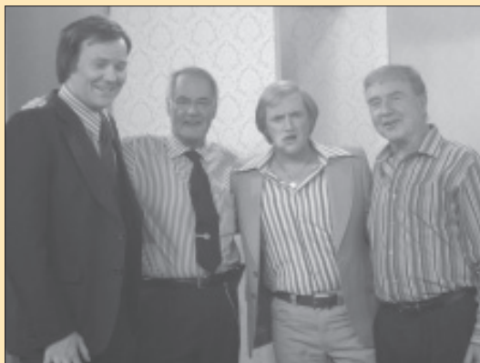
● Stephen Hall (as Bert Newton), Bruce Mansfield, Stephen Curry (as Graham Kennedy) and Philip Brady